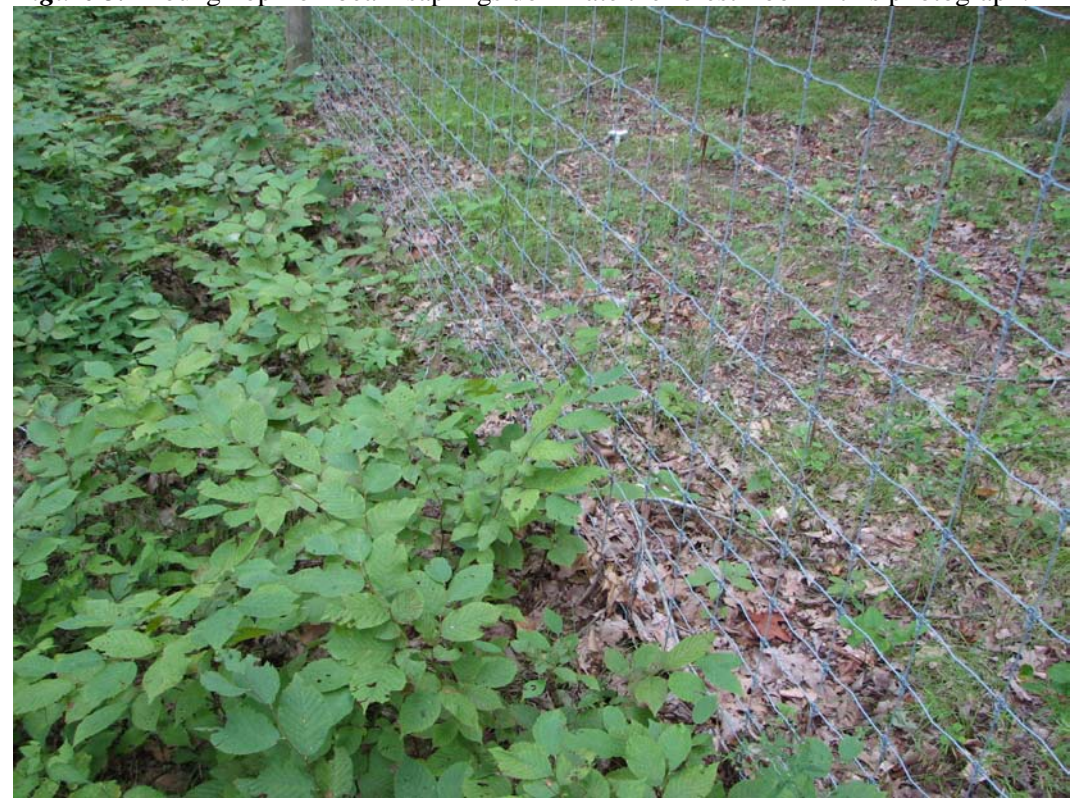
Figure 4. A close-up of the hop-hornbeam saplings shown in Figure 3.