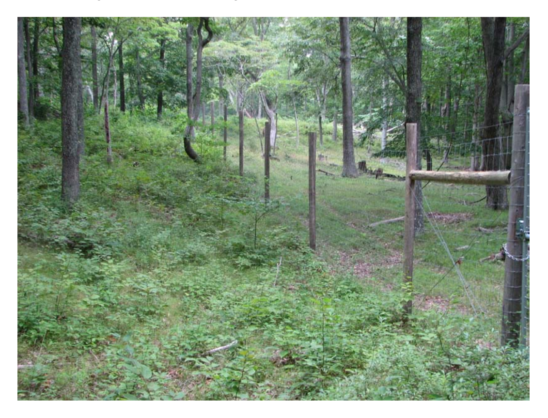
Figure 2. Vegetation conditions along a fence line. The crooked tree in the distance is the same tree appearing in Figure 1.