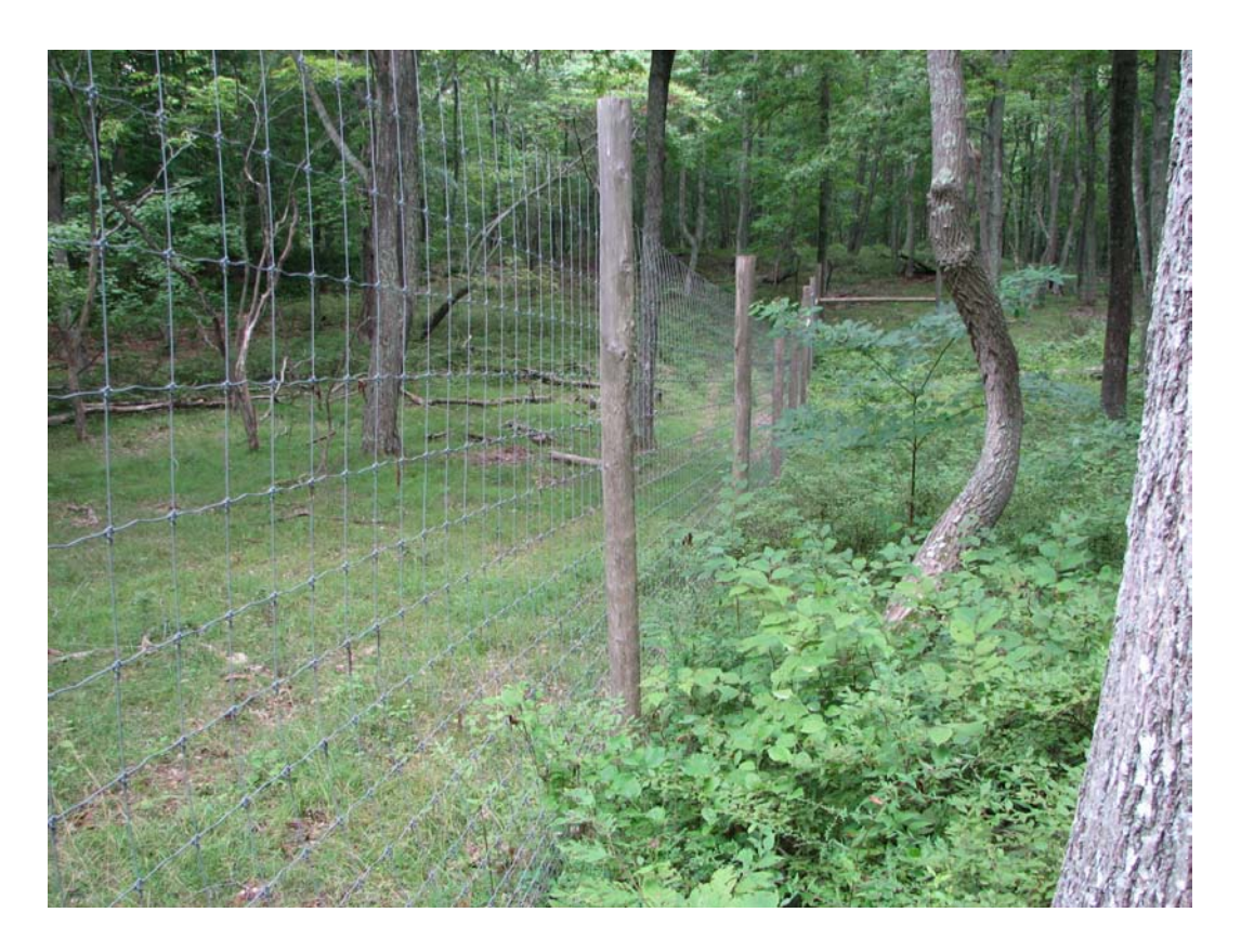
Figure 1. Vegetation conditions along a fence line.