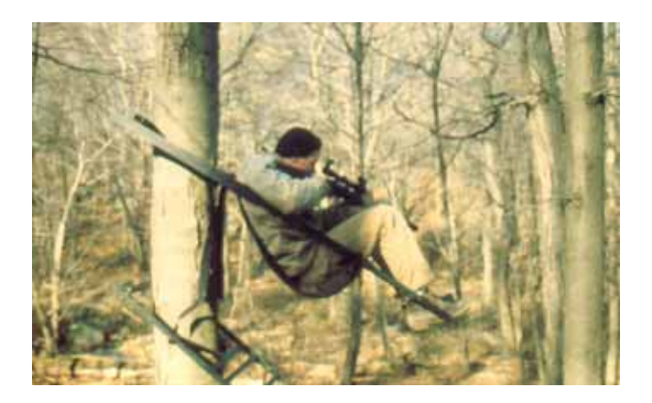
Figure 11. Agent using rifle to cull deer from a tree stand

between $200 to $400 per deer, which includes the cost of butchering. Several communities in New Jersey have successfully hired private contractors to shoot deer on properties that were deemed too small to allow for traditional hunting.