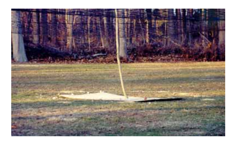
Figure 9. Drop net used to trap deer.

Deer may be trapped under a drop net, in a larger fence enclosure or in a box trap, and euthanized.