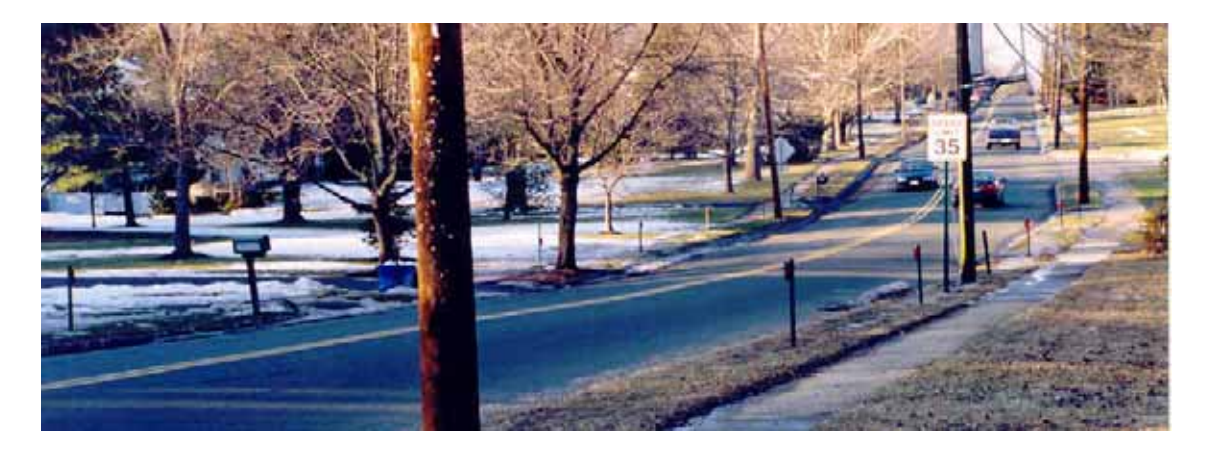
Figure 5. Roadside reflectors intended to deter deer from roads at night.

Some automobile owners have attached "deer whistles" to their vehicles. The whistles may emit a noise when travelling at a certain speed. This noise reportedly scares deer away from the road.