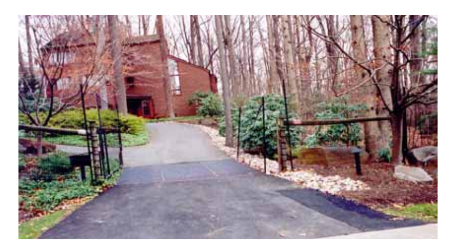
Figure 7. Cattle guards must be used with electric fence to exclude deer from property.

Solar-powered electric fencing may be used to protect shrubs or gardens. Fencing may be used to keep deer entirely off of a property. Cattle guards should be used in these situations to keep deer from walking up driveways into otherwise fully fenced properties.