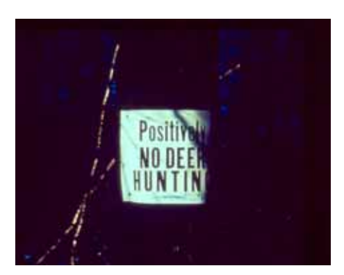
Figure 4. Hunter access is a critical component of deer herd management.

Publicly and privately owned natural areas that are closed to hunting will eventually become refuges for deer and cause over-abundance problems for the community. Frequently, such problems can be remedied by merely providing hunters with access to these lands. Publicly owned land containing wildlife habitat should be open to deer hunters before deer population problems escalate. Large pieces of private property where landowners do not allow deer hunting can create problems for neighbors.