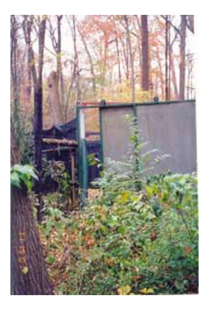
Figure 8. Deer trap with sensors for automatic door closing

The cost of trapping deer can be high. Wise and wary deer do not enter a trap readily. Municipalities using trapping as a deer control method in their communities have reported mixed success. Some trapping enclosures may cost up to $20,000 and private contractors charge additional capture and handling fees per deer.