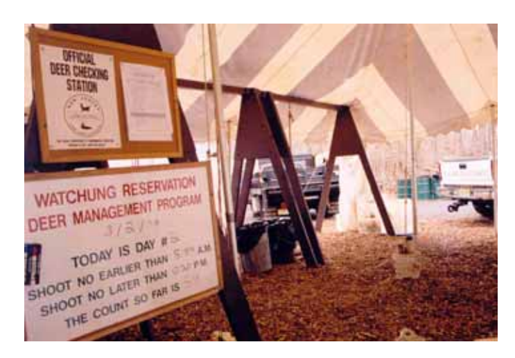
Figure 12. Deer check station at Watchung Reservation in Union County

hunters who participate in this program each receive 20 pounds of dressed venison. The remainder of the meat is donated to the Community Food Bank of New Jersey.