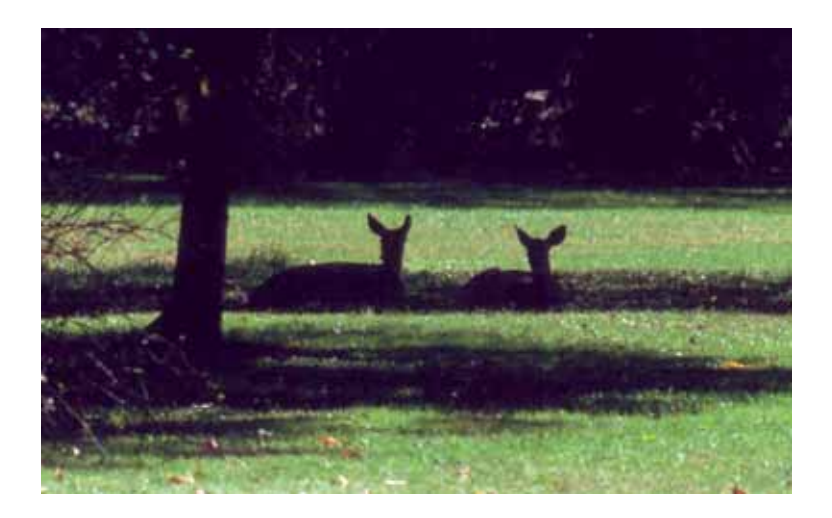
Figure 2. Un-hunted backyards provide refuge to deer.