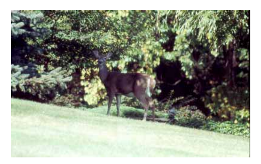
Figure 1. Lawns create the "edge" habitat preferred by deer.

Deer or more specifically, white-tailed deer ( Odocoileus virginianus ) have been a part of the natural landscape of New Jersey and have been interacting with man since prehistoric times. Prior to European colonization, deer populations may have increased and decreased slightly depending on weather and food availability without becoming terribly abundant by today's standards. The arrival of Europeans resulted in land clearing efforts for agricultural purposes – an extremely favorable situation for deer.