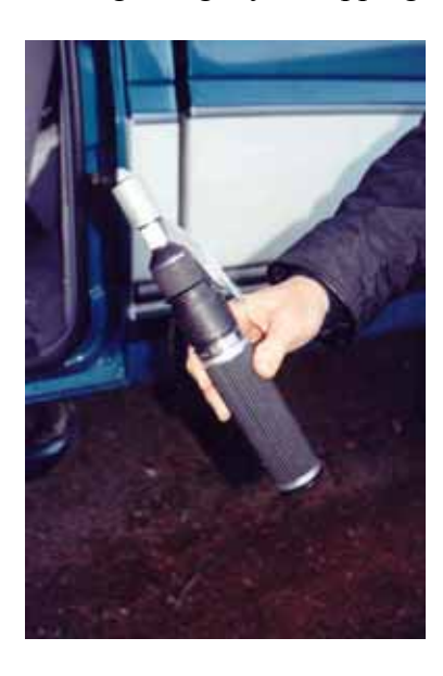
Figure 10. Captive bolt gun

In areas where firearms cannot be used due to safety concerns, deer may be trapped and euthanized. Deer are typically euthanized on site with a captive bolt gun. A captive bolt gun is a mechanical device used in commercial meat slaughtering operations to dispatch the animals. Although controversial, this method of euthanasia was deemed conditionally acceptable for free-ranging wildlife by the American Veterinary Association Guidelines on Euthanasia. In those areas where firearms cannot be used within a 450'-safety zone of a building, deer can be trapped and euthanized with a bolt gun legally. Trapping and euthanizing deer is very time-consuming and expensive.