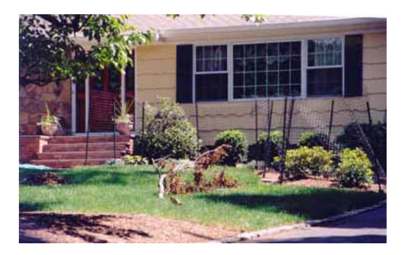
Figure 6. Fencing is used to deter deer from damaging gardens.

Fencing can be used by homeowners and the agricultural community to prevent deer damage to crops, shrubs and flowers. Fine netting is available from garden shops for homeowners who want to cover their shrubs and gardens.